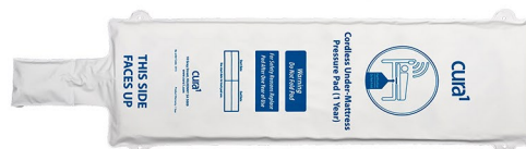
PART NUMBER: 3515