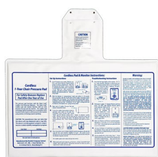
PART NUMBER: 2630