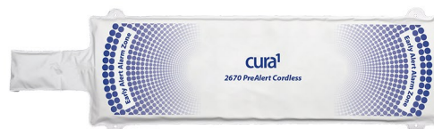
PART NUMBER: 2670